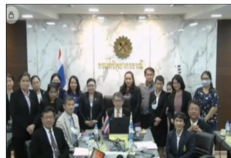
The DMR Group photo during the workshop