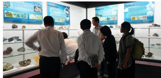
Lab Tour at Geological Museum