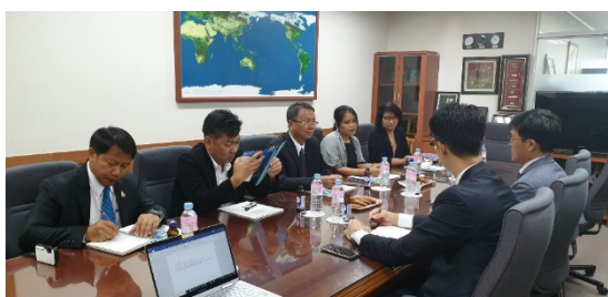
Wrap-up Meeting at Office of Global Cooperation Division