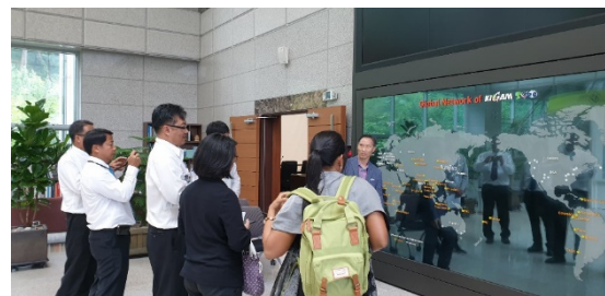
Lab Tour at IS-Geo