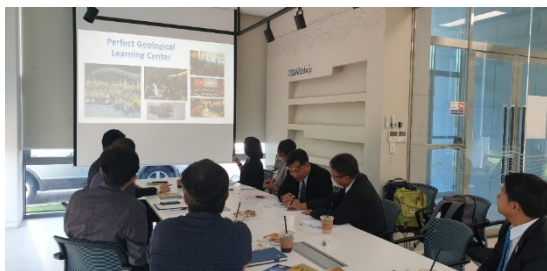
Meeting at KIGAM Lounge