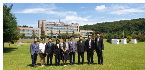
Group Photo for DMR and KIGAM Delegation